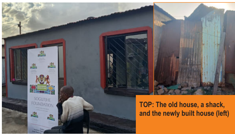
TOP: The old house, a shack, and the newly built house (left)