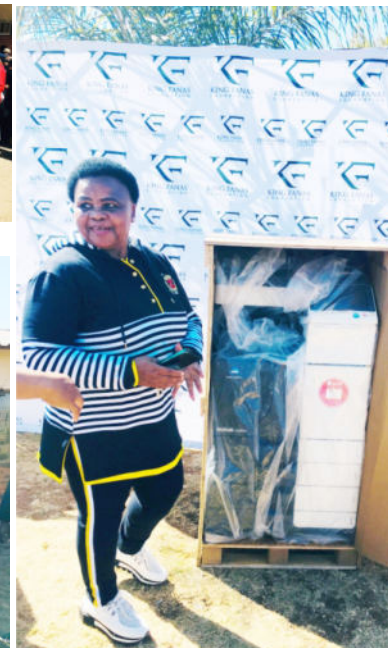
Various donations and renovation works were done, including a printer valued at R50,000, handed over to Sokapho Secondary School.