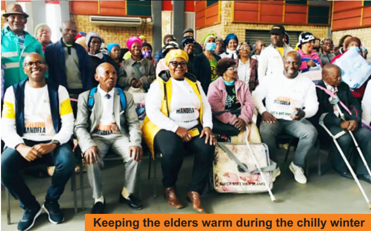
Keeping the elders warm during the chilly winter