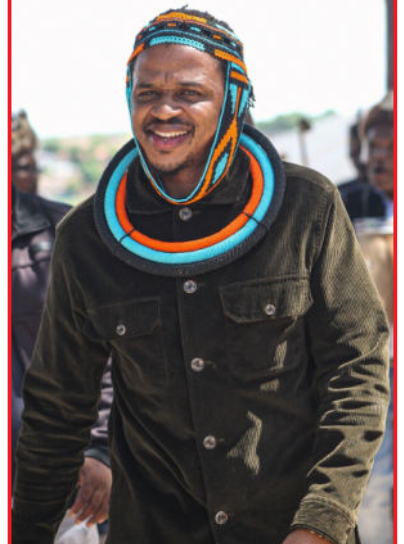
Ingwenyama Mabhoko III